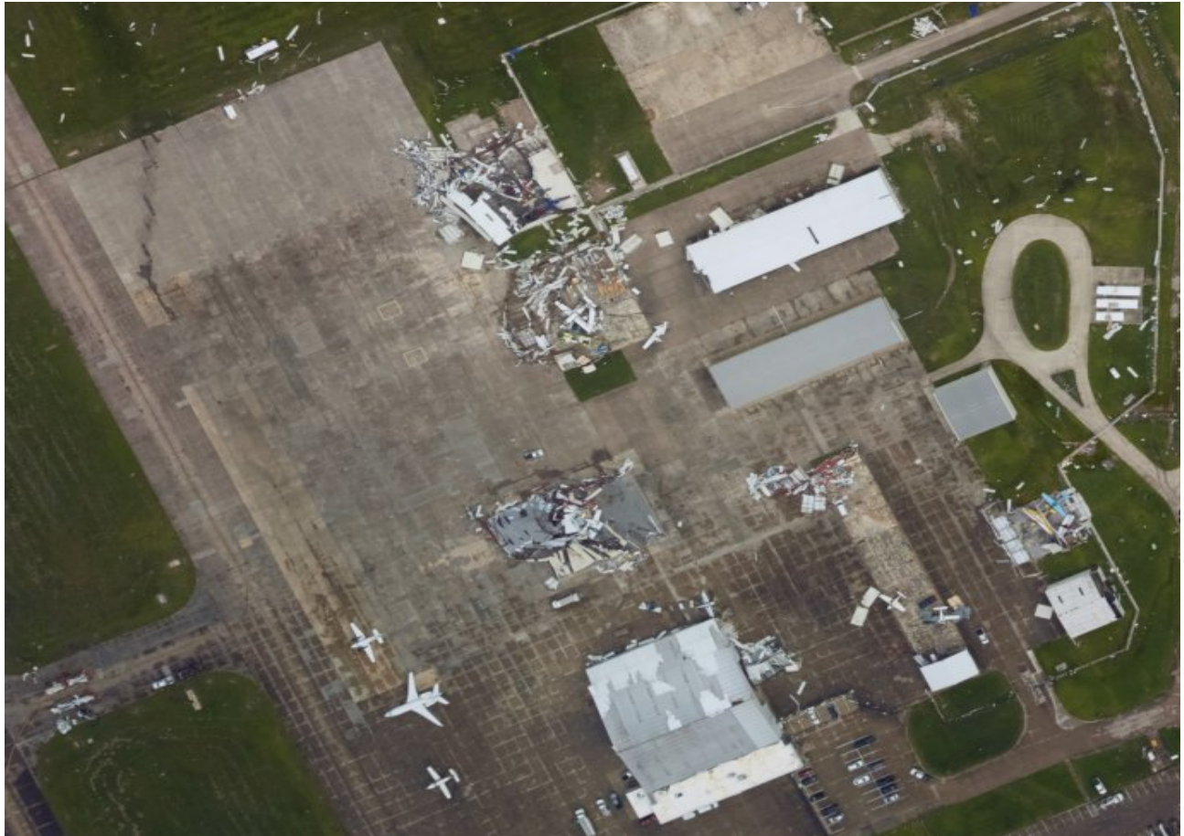
Figure 3 - Sample high resolution image of Lake Charles Regional airport before Hurricane "Delta"

In addition to marine hull and energy offshore assets, Skytek React has prepared a database of high-resolution imagery that maps damages associated with Hurricane "Laura" and in collaboration with several leading providers will be in a position to provide an analyze of additional damages related to the Hurricane "Delta".